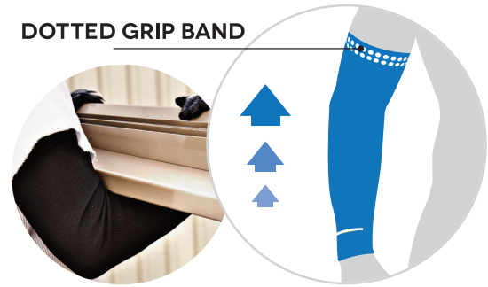
DOTTED GRIP BAND

No more slipping! Sleeves with arm openings featuring "STAYz-Up" technology hold up—comfortably gripping onto underlying fabric or skin to ensure sleeves stay in place, and keep you protected no matter what. Unlike other products on the market, we won't let you down.